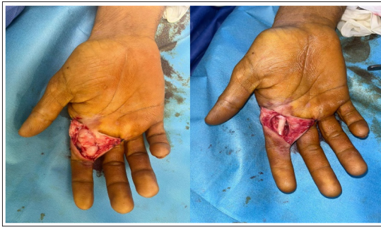
Figure 2: Surgical Excision Under Locoregional Anesthesia Using a Palmar Zig-Zag Approach to the Index Finger.

A biopsy-exeresis was performed under locoregional anaesthesia (plexus block), using a palmar approach centred on the swelling via a zigzag incision. This allowed complete marginal removal of the tumour with release of the flexor tendon (Figure 2), followed by histological examination confirming a GCT with no sign of malignancy.