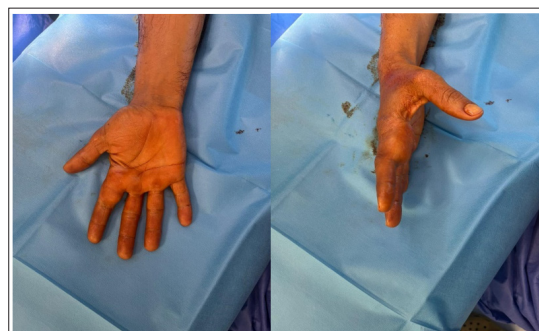
Figure 1: Clinical Appearance of Swelling Over the MCP Joint of the Second Finger.

a firm swelling, mobile in relation to the superficial and deep planes, measuring 2 cm in its long axis. It is located opposite the metacarpophalangeal joint (MCP) of the second finger (index). The patient was afebrile and in good general condition. Finger mobility was preserved, with no pain or limitations. No local inflammatory signs or vascular nerve damage were observed (Figure 1).